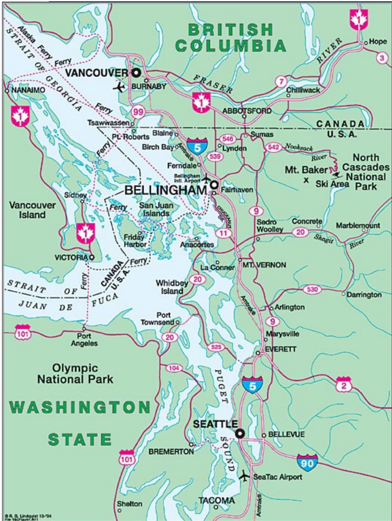
Map of Western Washington